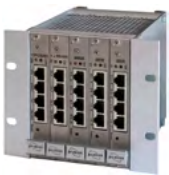
Example of basic unit I

The IDT 32 is a modern high end control panel with wide-ranging application in the areas of alarm monitoring, fire detection and video surveillance. Through its modular construction, the best, bespoke, Plug-&-Play customer solutions can be created, using the up to 21-slot units.