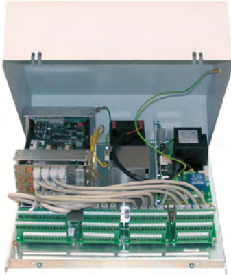
Basic unit III, with wall-mounting housing, fully populated