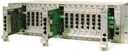
Example of 19" version, fully populated, basic unit II